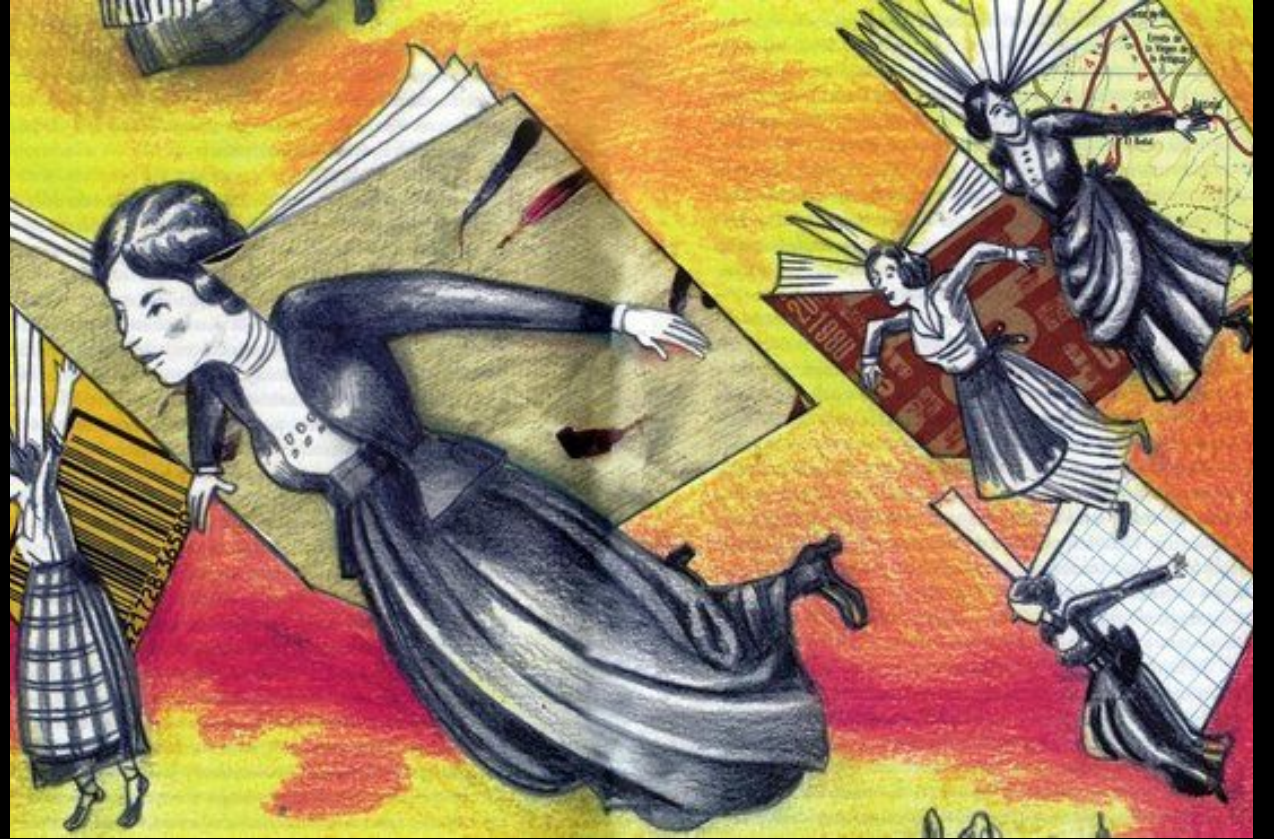
Illustration by Antonia Santolaya for the book "La mujer del porvenir"