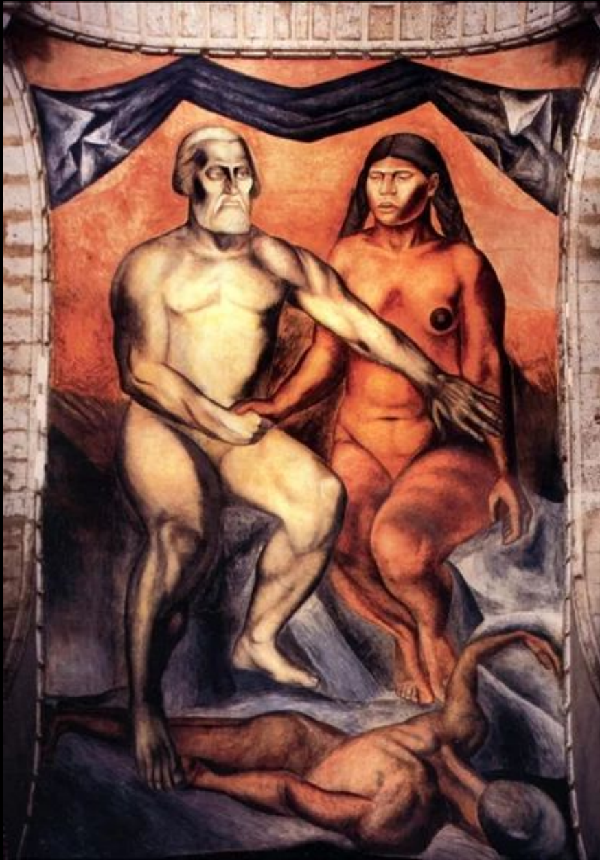
Mural "Cortés y La Malinche" by José Clemente Orozco